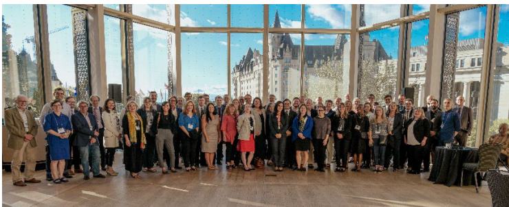
2024 Clark W. Dalton, K.C. Reception, National Arts Centre