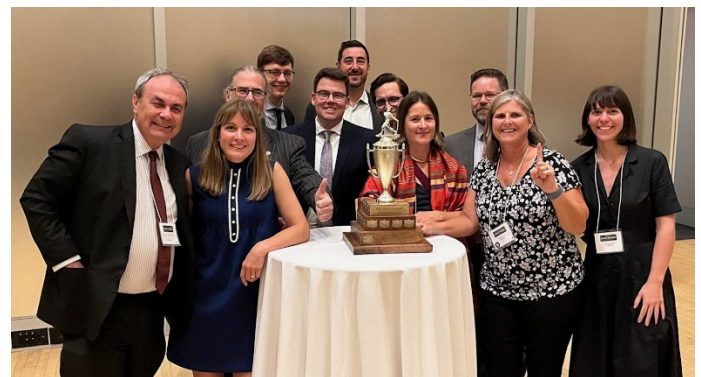
East Team – winners of the 2024 annual East vs. West softball game

I would also like to acknowledge all Jurisdictional Representatives, delegates and working group members for their continued efforts towards improving Canada's legislative landscape. I look forward to the upcoming months and to seeing everyone in person again in Halifax.